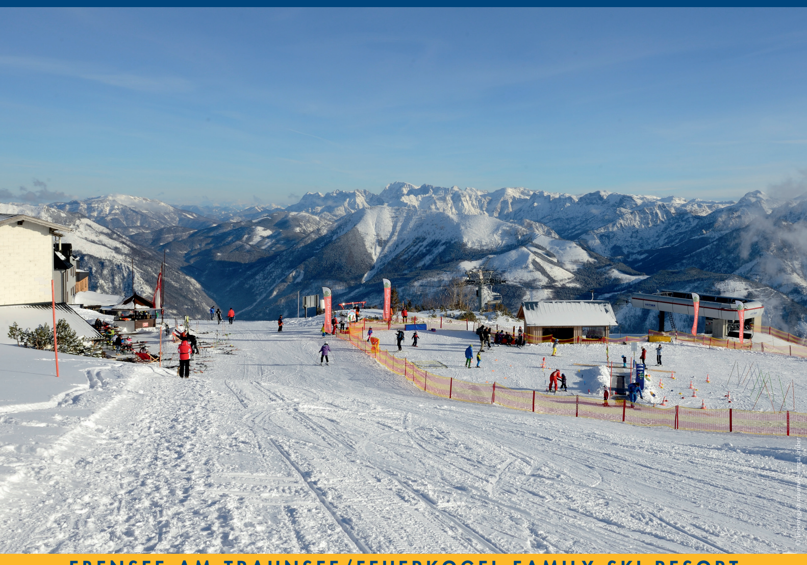
EBENSEE AM TRAUNSEE/FEUERKOGEL FAMILY SKI RESORT RESERVATIONS AVAILABLE: 16th DEC. 2023 - 1st APRIL 2024